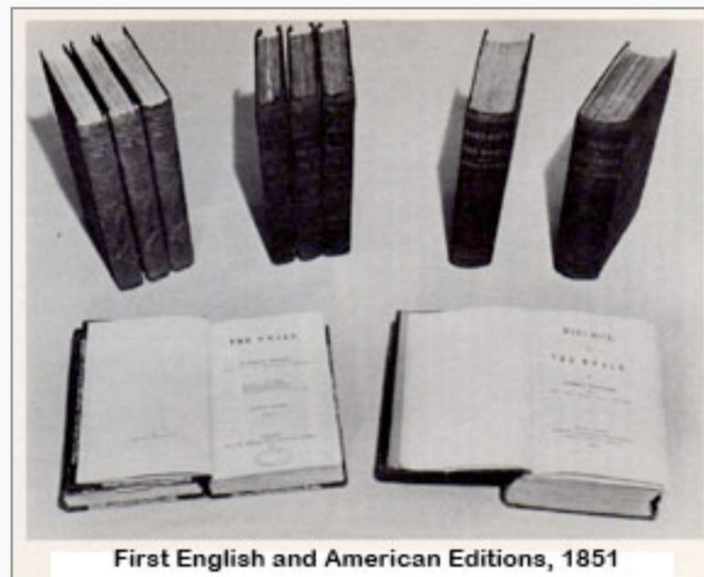
First English and American Editions, 1851

During his lifetime, Melville published nine book-length works of fiction, a collection of tales, and four volumes of poetry. At his death, among other documents, he left in manuscript several uncollected tales (including Billy Budd), numerous poems (including Weeds & Wildings), and a handful of reviews, including his literary manifesto "Hawthorne and His Mosses." Most of Melville's manuscripts appeared posthumously in print. For various reasons, almost every Melville title exists in multiple versions, either in print or manuscript, due to